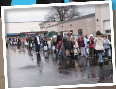
Hundreds of students from Traverse Heights Elementary walk to the Foundation to deliver their donations of food.