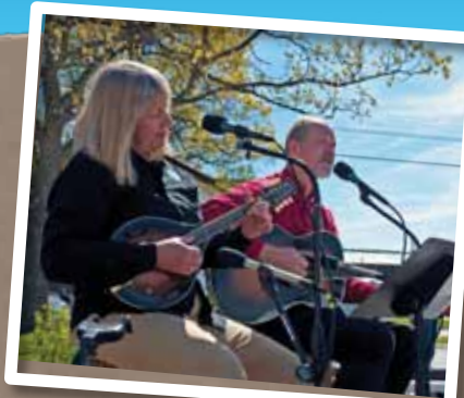
Cherry Blossom Ramblers donate their musical talents to make the Spring Garage Sale Fundraiser festive.